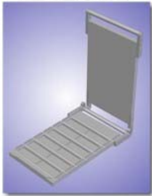
D813 Ultra-Life Specimen Mold

CCSi Ultra-Life molds are designed, engineered, and manufactured to produce high quality specimens, over an extended service life!