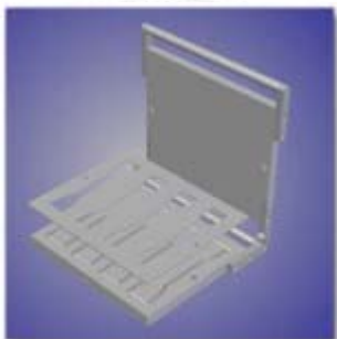
A Typical TriPlate Mold

The CCSi Ultra-Life TriPlate is a dual platen, center plate, configuration designed specifically for specimens which are typically die cut. The unique TriPlate design features a centrally positioned, 'stacked' plate located between two platens. The 'sandwiched' plate precisely mold-forms the specimen between the two hinged platens.