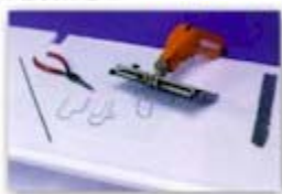
Bendable Blade Material